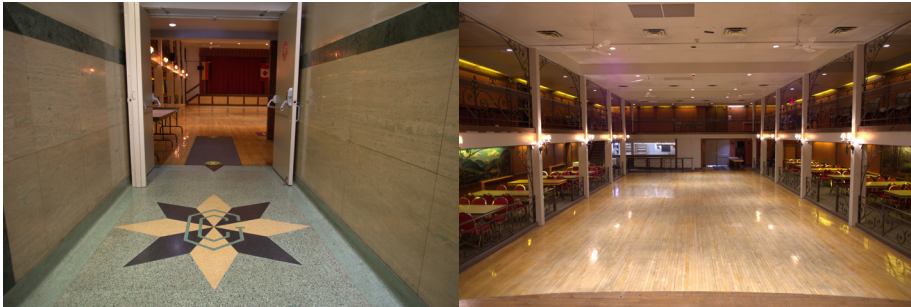
Entrance to the large hall with nice design in the Terrazo