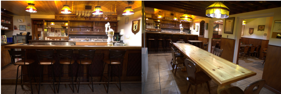
Rathskeller bar ready to serve